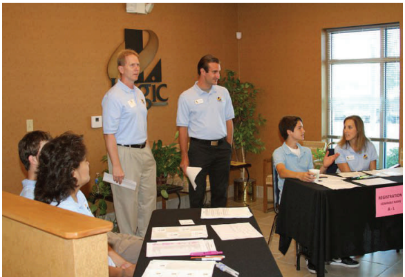
Logic Team Members Help with the Open House.