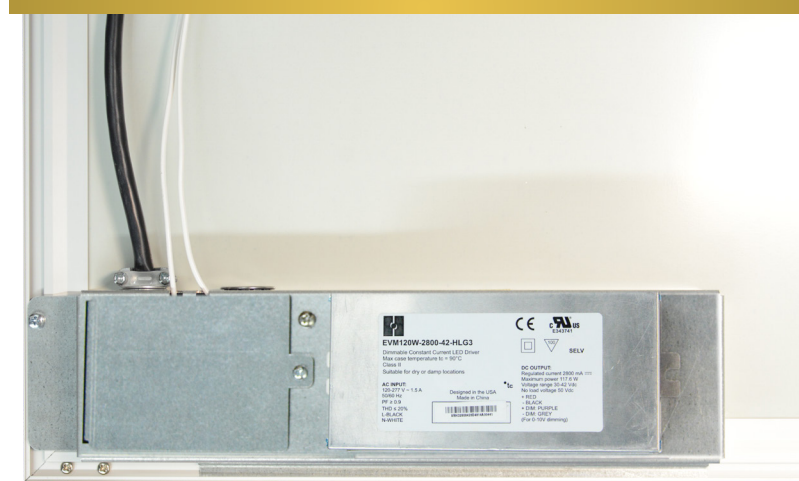
Back of Flat Panel showing wiring/power casing